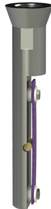
Applied Stress Coupon Holder Assembly

Casing coupons are manufactured from drill pipe casing and are used to in lab tests to evaluate the effects that different gases or drilling muds can have on drill pipe.